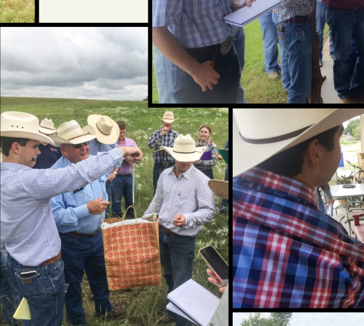
E.C. Cattle 9.24.18