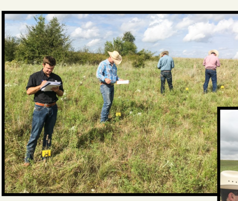
Plant ID 9.5.18